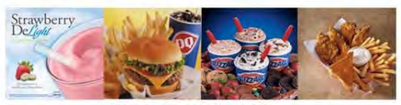
PROUD TO BE A PART OF THE COMMUNITY!