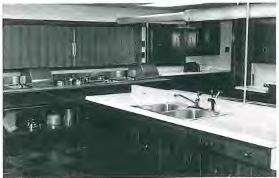
The most recent project of the Ladies Aid has been the renovation of the kitchen in the school basement.